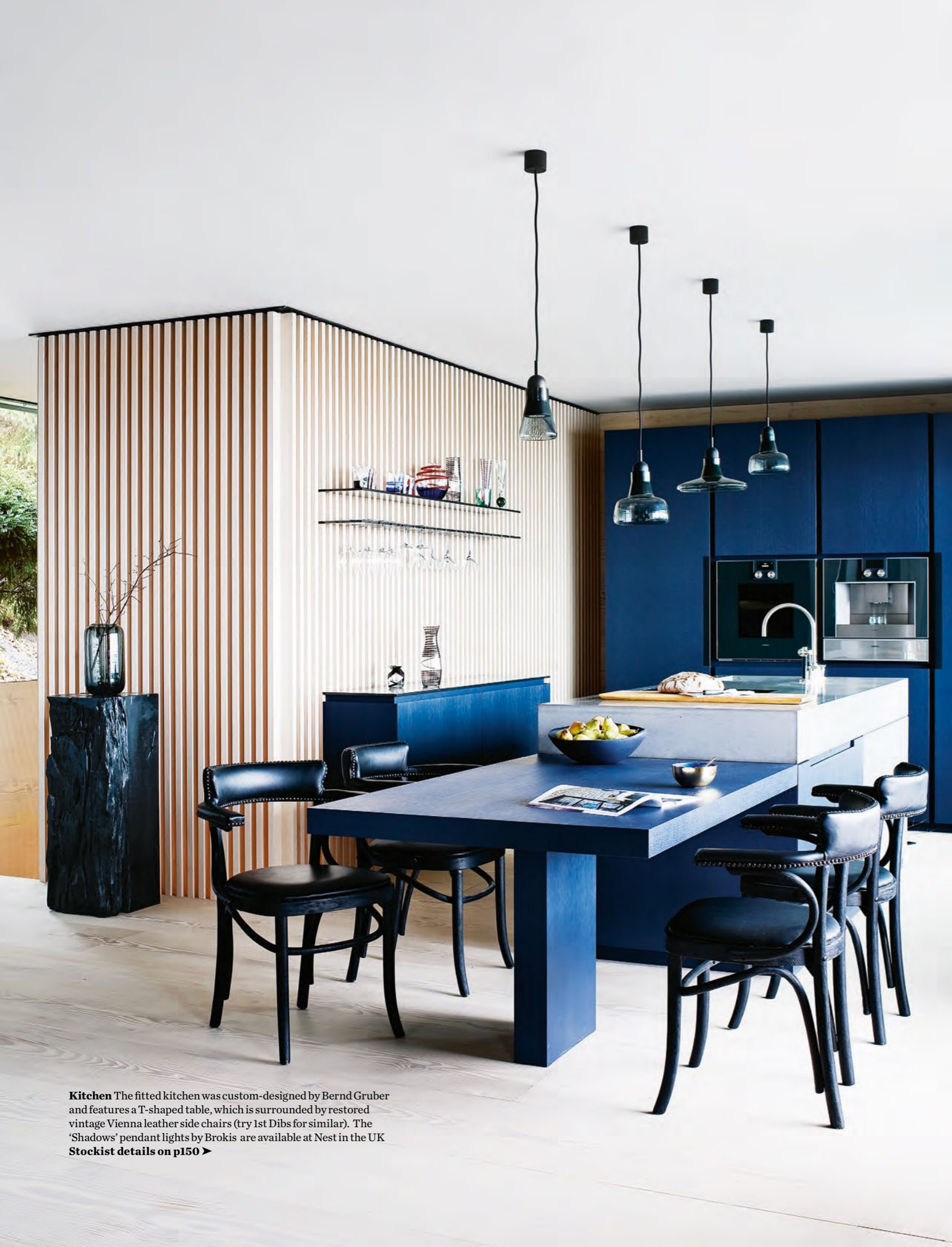
Kitchen The fitted kitchen was custom-designed by Bernd Gruber and features a T-shaped table, which is surrounded by restored vintage Vienna leather side chairs (try 1st Dibs for similar). The 'Shadows' pendant lights by Brokis are available at Nest in the UK Stockist details on p150 ►